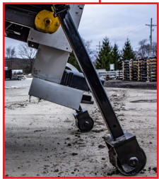
Detachable Ground Rollers