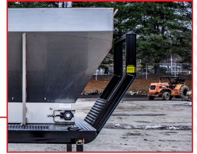
12" Angled Front Extension