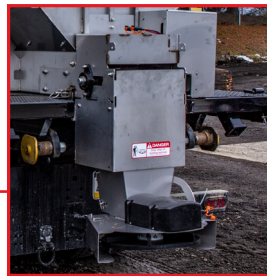
Electric Conveyor and Spinner