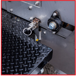
9" Rear Cutout for Conveyor