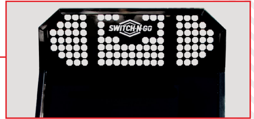
51" Height Bulkhead