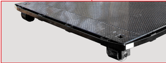
Optional No Beavertail w/ 6" Ground Rollers