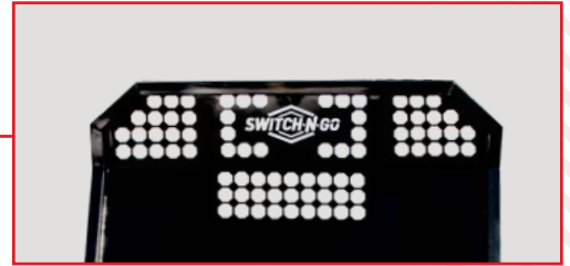
39" Height Bulkhead