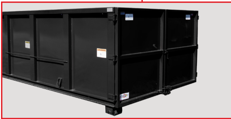
Single swing or barn doors