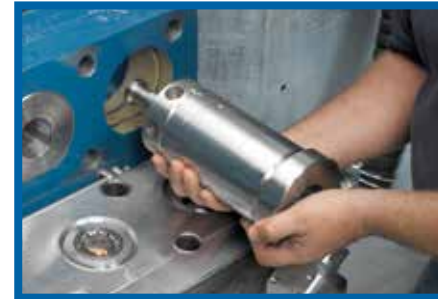
Pressures from 550 to 2750 bar