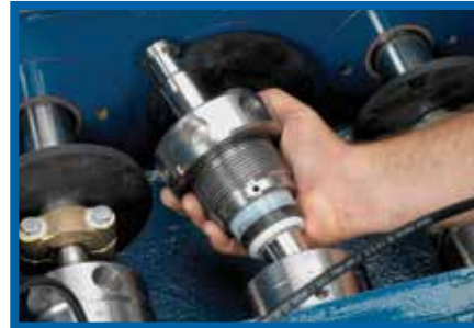
5-minute packing change