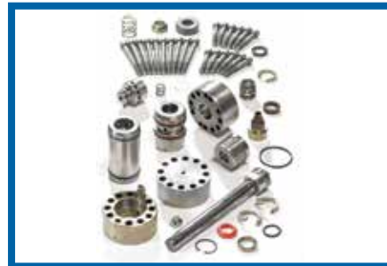
The other guys