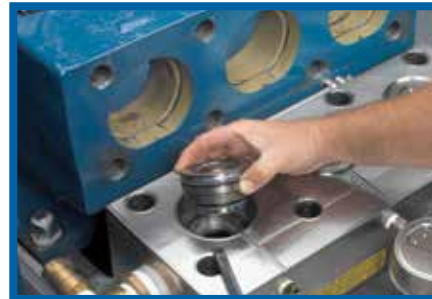
15-minute valve cartridge change