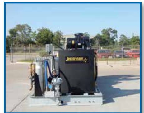
Jetstream Guardian™ Water Tank