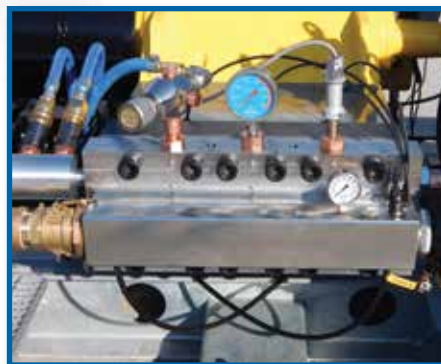
UNx Fluid End