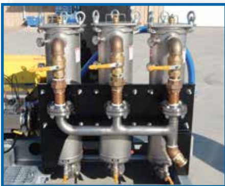
Triple Filtration System