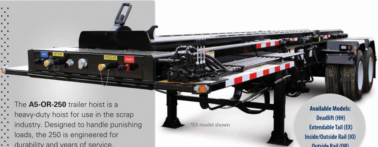
*EX model shown

The A5-OR-250 trailer hoist is a heavy-duty hoist for use in the scrap industry. Designed to handle punishing loads, the 250 is engineered for durability and years of service.