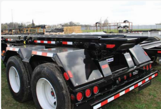
*EX model shown