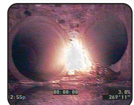
•• Location of Hidden/Buried Stormwater Vault